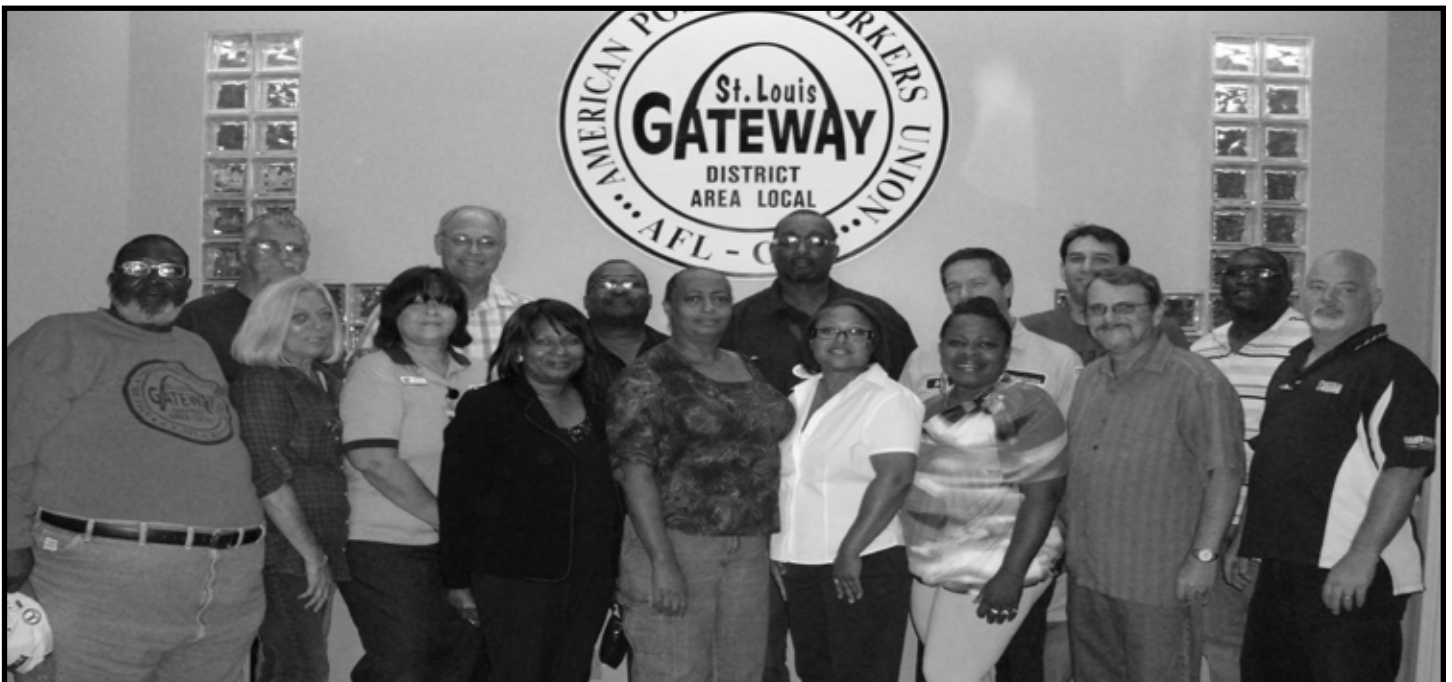
The Newly Elected Officers of the St. Louis Gateway DAL were sworn in on 9-8-2010

God bless you and thank you from the bottom of my heart.